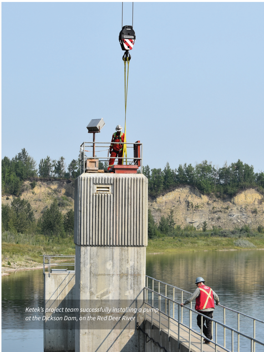
Ketek's project team successfully installing a pump at the Dickson Dam, on the Red Deer River