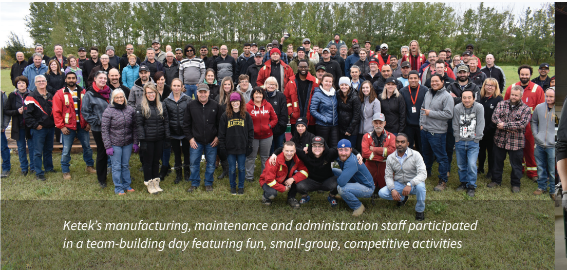
Ketek's manufacturing, maintenance and administration staff participated in a team-building day featuring fun, small-group, competitive activities