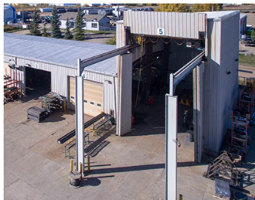
Two 7.5-Ton Cranes