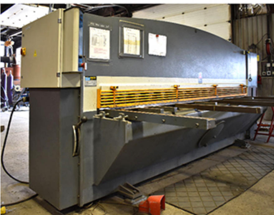
10' Shear Machine