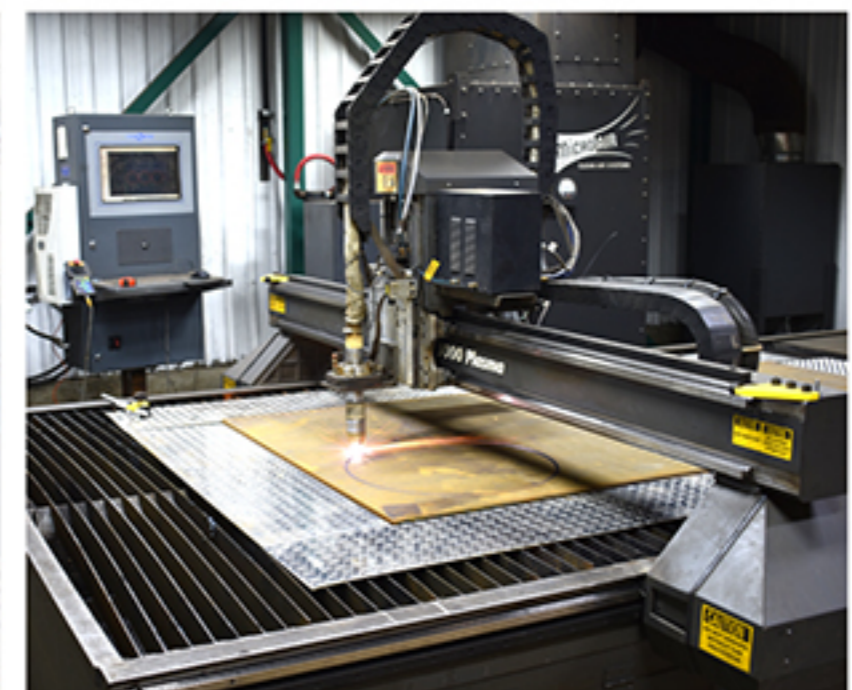
MultiCam 3000 plasma cutter