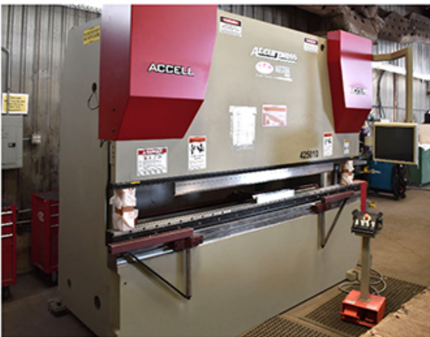
250-ton precision brake press